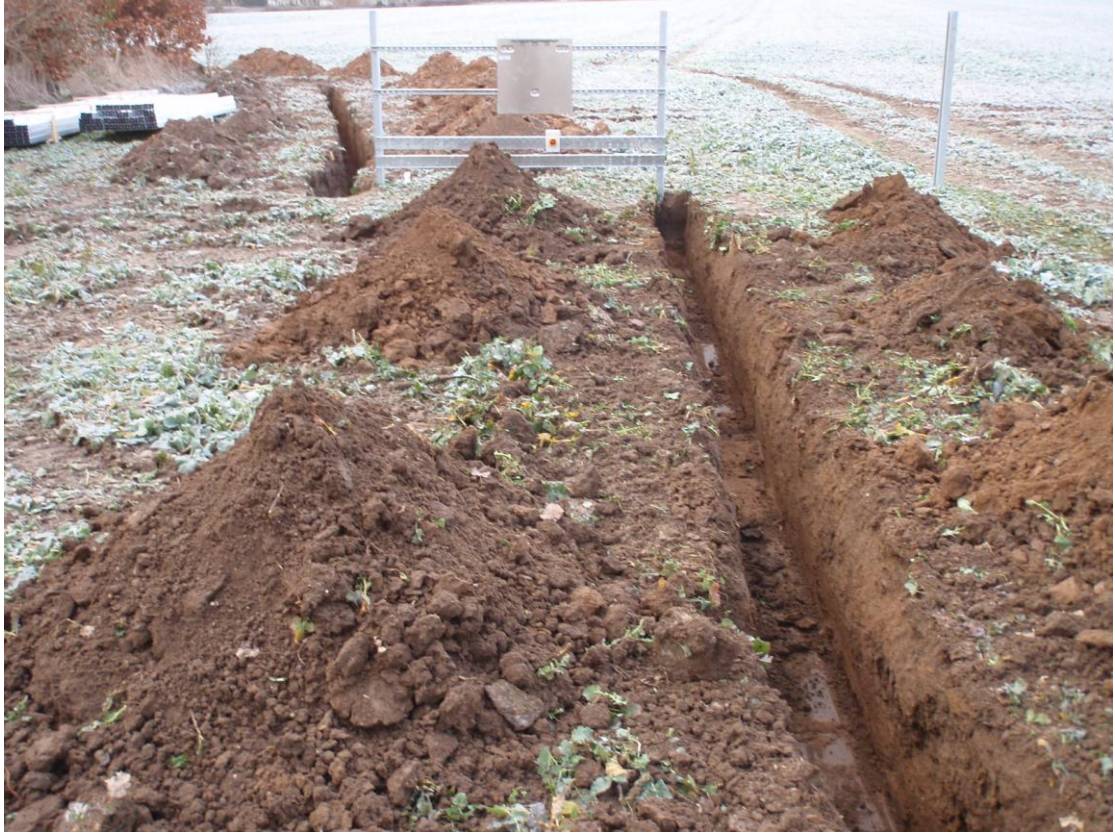
Plate 2. Showing excavation for cabling (facing north-west)