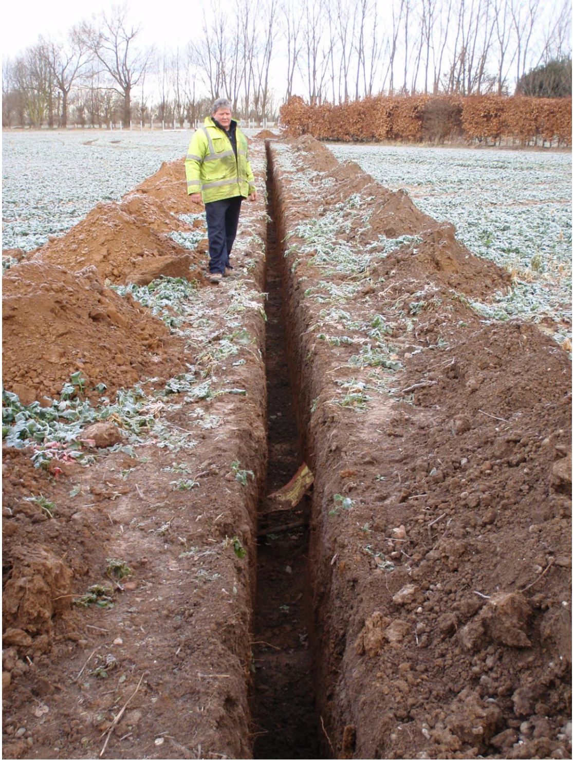
Plate 1. Showing excavation for cabling (facing north)